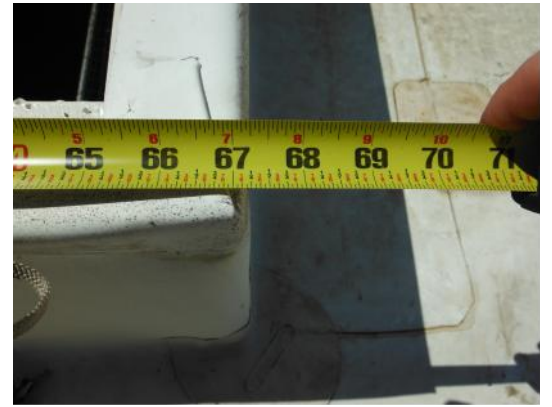
Remove skylight, or measure curb only, not skylight frame