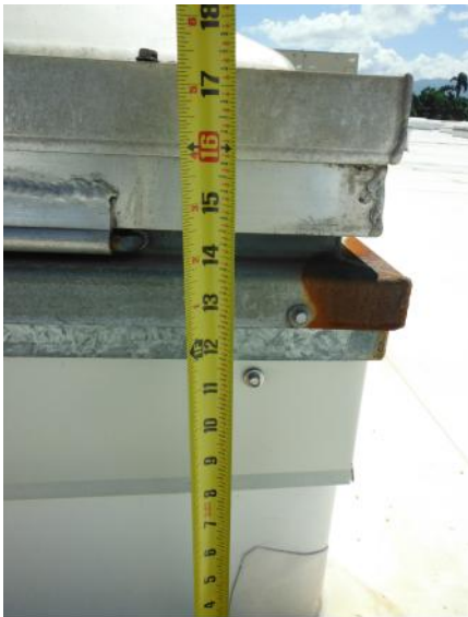
How to measure curb height