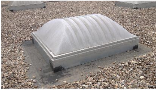
Typical Curb Mount Skylight