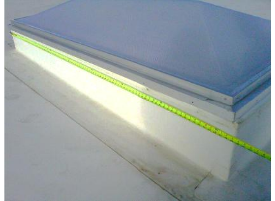
Measure Curb Outside Dimensions – NOT skylight frame